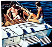
Swim platform and grab rails