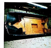
Solid laminated sub-floor structure