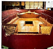
Foamed in-place flotation installation