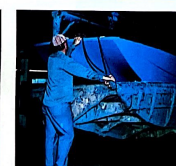
Quality finish right out of the mold