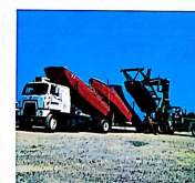
Experienced shipping department