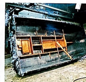
Rugged hull reinforcement