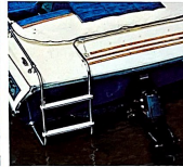
Stern ladder on Shark