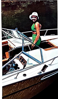
Walk-through windshield with tinted safety glass

Caravelle's advanced designing is not only illustrated in its high standards of quality and performance but in newly designed features that offer a Caravelle owner pleasurable convenience. Special note is to be given to the side switch panel with open storage compartment; fiberglass swim platform with grab rails; and under-floor storage. The following is a list of items of the standard equipment on most of Caravelle's models.