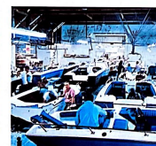
ConveyORIZED assembly department