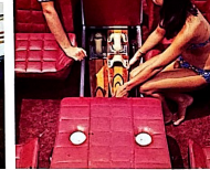
Under floor storage