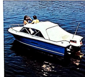
Canvas package—top, bow, stern and side