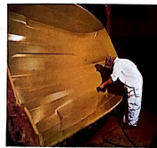
Quality controlled gelcoat coating

SAFE BOATING PRACTICES Transport your boat at a moderate speed with top down and properly stowed • Secure walk-through door when trailering • Before launching, secure drain plug • Ventilate engine compartment for several minutes before starting engine • Carry a fire extinguisher, Coast Guard approved life vest for each passenger, rope, paddle and a flashlight • Do not smoke or use matches when fueling or checking engine • Be familiar and observe Coast Guard regulations and local laws.