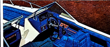
Side switch panel with open storage compartment