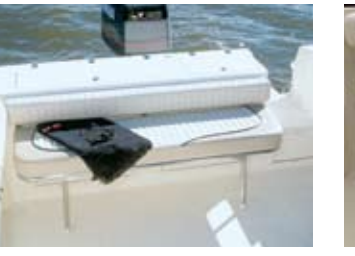
BENCH SEAT The optional fold down rear bench seat adds comfort and seating capacity.