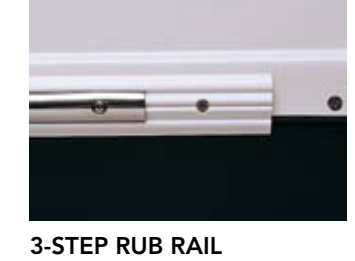
3-STEP RUB RAIL Extra wide rub rails offer superior hull side protection against dockside scrapes and dings. The optional stainless steel insert adds to the distinctive look of your SeaHawk.