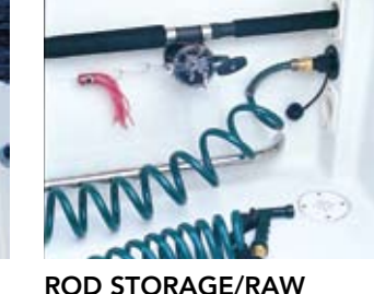
WATER WASHDOWN All models include both horizontal and vertical rod holders. A conveniently located, raw water washdown is standard on most models.