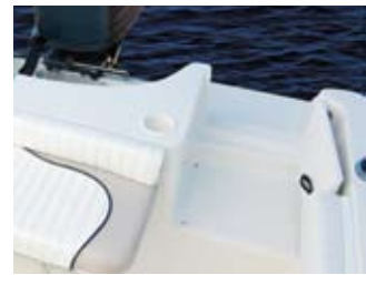
WALK-THRU TRANSOM Allows for easy entry at dockside even when loaded with dive tanks and gear. No more awkward crawling across the transom of the boat.

The NMMA Certified label on a Seahawk boat lets you know it was built to meet and exceed the industry's strictest quality and safety standards for critical components such as electrical systems, powering, flotation, fuel systems and navigation lights.