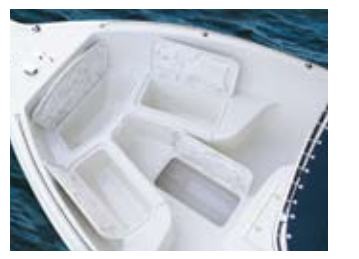
INSULATED FISH BOX & BOW STORAGE The large five-foot fish box and bow storage areas have hinged fiberglass lids. All are insulated and drain overboard. Seals: