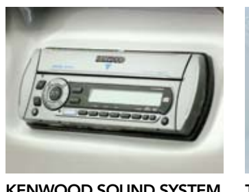
KENWOOD SOUND SYSTEM An optional waterproof Kenwood CD player with 4 speakers is available on all SeaHawk models. TILT STEERING WHEEL For added comfort and convenience, tilt steering is standard on all models.