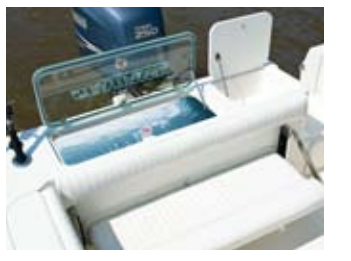
TRANSOM WORK STATION The convenient work station, strategically located at the transom, features an aerated baitwell and a sink with a fresh water system.