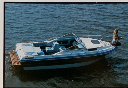
Walk around easily to bow pulpit with sturdy, welded, stainless steel rail.