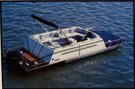
Wraparound Seating with Abundant Under-Seat and Aft-Deck Locker Storage