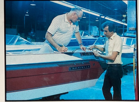
Quality control inspections based upon rigid specifications cover 185 checkpoints.