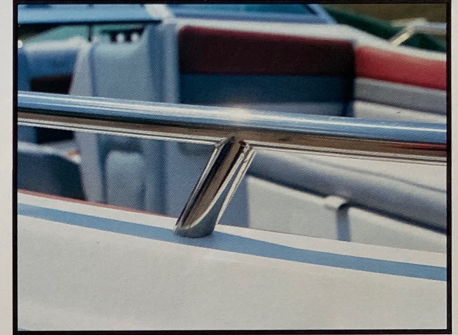
Welded stainless steel bow rails resist the elements.