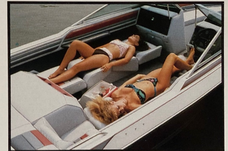
Convertible sun loungers add versatility to the luxurious, color-coordinated interior.