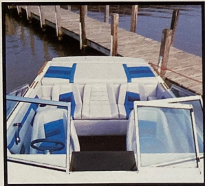
Optional Seating Shown: Captains' Chairs with Bench Seat and Large Sun-deck.