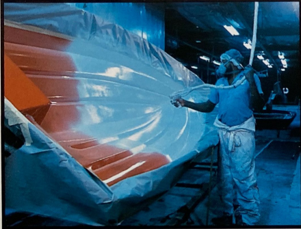
The best NPG Gelcoats are used for long-life finish.