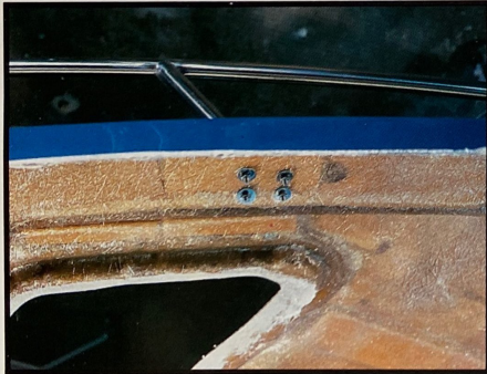
Thru-bolting of load-bearing hardware for dependability and safety.