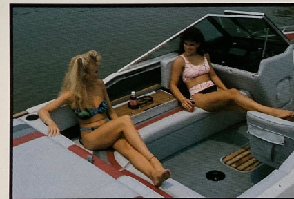
Functional, Fold Down Side-Panel Beverage Tray