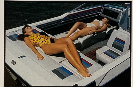
Convertible Jump Seat and Sun Lounger Seating Adds Versatility To Stylish Interior.