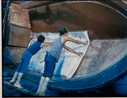
Hand laid 24 oz. woven roving insures a strong and durable hull.