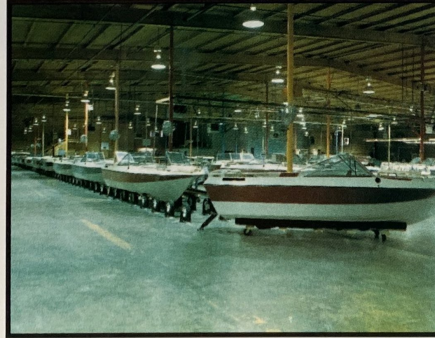
Modern, efficient assembly methods assure consistent construction.