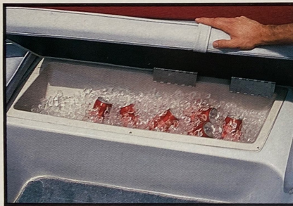
Accessible, Overboard Draining, Bow Area Ice Compartment.