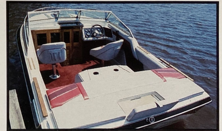
Aft Sun Deck with Built-In, Insulated, Overboard Draining Ice Compartment.