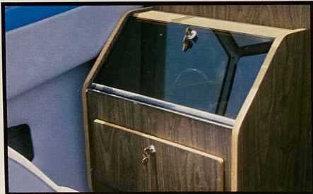
Port Console with Sink, Fresh Water Storage and Locking Glove Box is Standard.