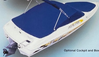
Optional Cockpit and Bow Cover