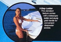
3-Step Ladder This standard feature comes with a telescopic ladder and sturdy grab handle for convenient deepwater access.