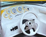
Sport dash features a digital hour meter, digital depth finder, 88 steering, 12-volt receptacle and a CD player.

The Interceptor 232 arrives with muscular appeal and gets your pulse pumping with a powerful V-8 engine. This boat looks great, performs great and when equipped with the switchable thru-hull exhaust, even sounds great. The huge bow area and sizable storage for all your gear enhance every outing in this unique boat. Get excited about boating all over again, with the Interceptor 232 Bowrider.