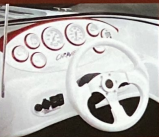
Sport dash features full instrumentation with depth finder, hour meter, CD player, 12-volt receptacle, and tilt steering.