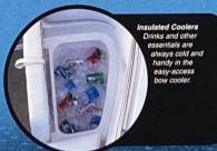
Insulated Coolers Drinks and other essentials are always cold and handy in the easy-access bow cooler.