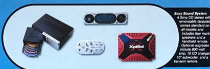
Sony Sound System A Sony CD stereo with removable faceplate comes standard on all models and includes four marine speakers and a handheld remote. Optional upgrades include 800 watt amp, 10 CD changer, 10" subwoofer, and a transom remote.