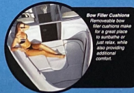
Bow Filler Cushions Removable bow filler cushions make for a great place to sunbathe or just relax, while also providing additional comfort.