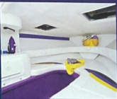
Sport cabin interior