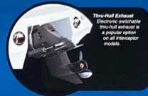
Thru-Hull Exhaust Electronic switchable thru-hull exhaust is a popular option on all Interceptor models.