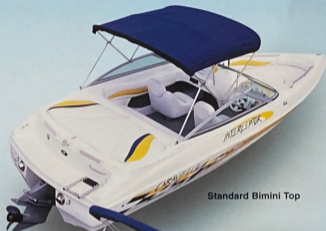
Standard Bimini Top