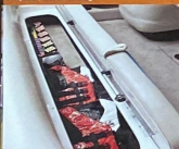
The hinged rear bench seat offers abundant storage and is long enough to accommodate skis.

Think of the activities you enjoy on the water.