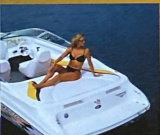
Spacious and comfortable seating.