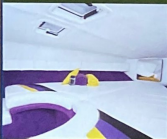
Sport cabin features storage under cushions and behind the mirror.