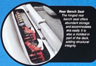
Rear Bench Seat The hinged rear bench seat offers abundant storage and accommodates skis easily. It is also a molded-in part of the deck, adding structural integrity.