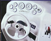
Stylish dash comes with color-coordinated bezels, full instrumentation. Shown with optional Kiekhaeffer controls