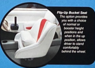
Flip-Up Bucket Seat This option provides you with a choice of normal or booster height positions and when in the up position, allows driver to stand comfortably behind the wheel.