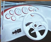
Sport dash features full instrumentation with depth finder, hour meter, CD player, 12-volt receptacle, and tilt steering.