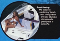
Sport Seating The spacious sundeck w/ bench-seat configuration provides abundant storage and a great place to sunbathe.