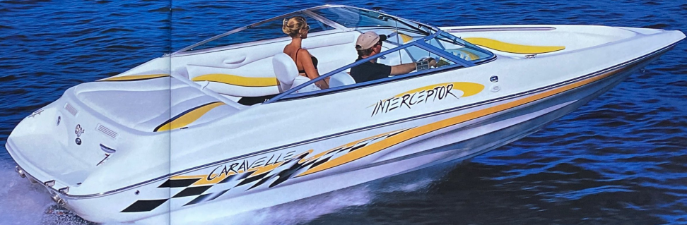
232 Bowrider shown in Lightning color option.