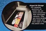
Hinged Ski Storage Our carpeted aluminum ski locker lids are more convenient than nonhinged versions. They are more durable than wood, and won't stain or fade like plastic ones.