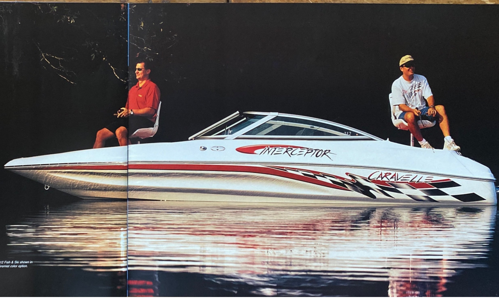
212 Fish & Ski shown in Firemat color option.