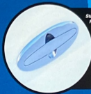
Stainless Steel Package For a sleek look opt for the popular stainless steel package featuring a stylish, stainless steel rub rail and five recessed put-up cleats.