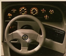
Instrumentation in the 175 bow rider includes critical engine monitoring gauges as well as a tachometer, speedometer and a trim indicator gauge. A straight-forward design that's more unusual than you might think.

Of course you want your family's boat to be functional, safe and affordable. You would like a comfortable interior and great styling. And you would like a boat that is fun to drive. Is it unreasonable to ask for all that in one boat? Not if your boat is a Caravelle 175 bow rider. We engineered this boat in the same manner as we engineer our larger boats. To offer obvious quality in a class that sees mostly compromise. To add thoughtful details that provide comfort and beauty. To give the 175 bow rider the quality, spaciousness and a level of fit and finish normally reserved for much more expensive boats. The Caravelle 175 bow rider is a boat you can afford to get excited about.