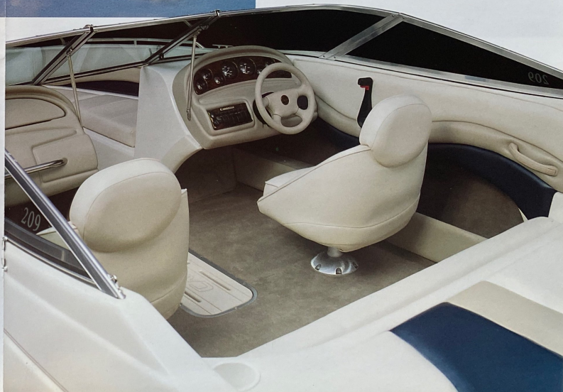
Y Contoured interior side panels add a sense of luxury and completeness to the interior of the 209. High sided bucket style captain chairs are as functional as they are beautiful.