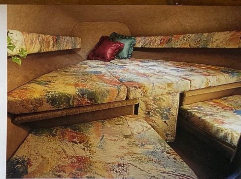
A The comfortable cushions conceal three generous storage compartments and an optional self-contained marine head.

Specifications Centerline: 20'6" Maximum Beam: 9'6" Maximum Engine: 300 hp Fuel Capacity: 50 gal Weight (approx): 3000 lb.