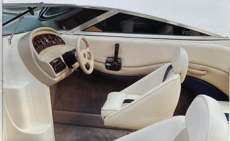
Y The 209 cuddy cabin is big on interior space, and this roomy cockpit is big on detail, too. Notice how the upholstery colors in the cockpit blend with the instrument panel. The two molded-in fiberglass steps that offer easy access to the bow flow smoothly with the rest of the lines in the cockpit. Even the clear, curved windshield features a sleek, rounded frame.