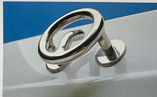
A The extra large stainless steel ski tow eye is another of the seemingly minor details that make the 209 bow rider a pleasure on the water. Skiers will appreciate the ease with which a ski rope can be attached to the ski tow eye.