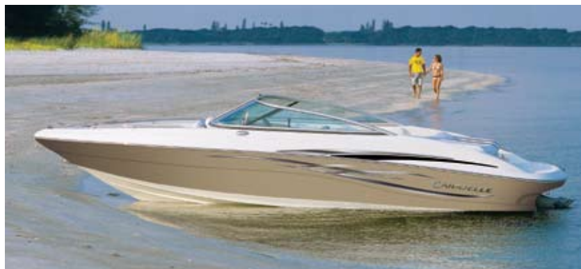
Shown with the Platinum Graphics Option