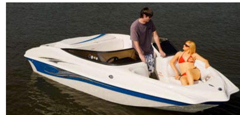
Shown with Black Low Profile Windshield Option